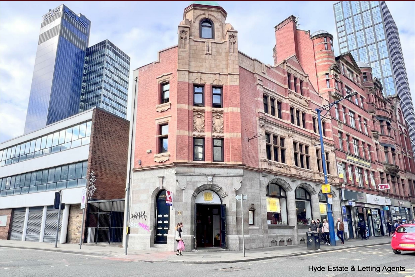
Hyde Estate & Letting Agents