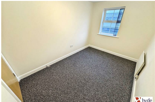
1 St. Margarets Road, Prestwich, Manchester, M25 2QB